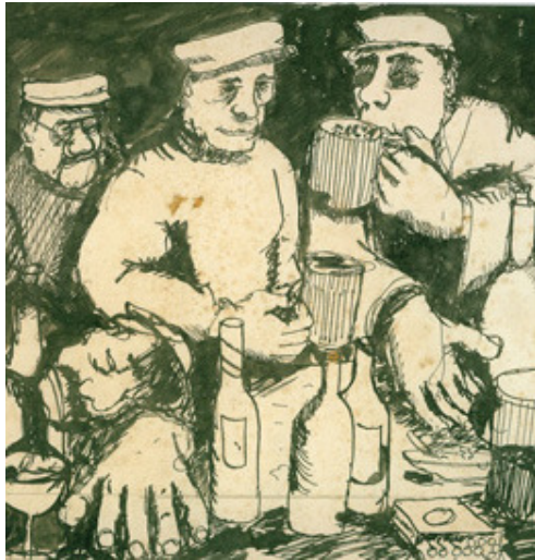
From Burningham's Glasgow sketchbooks

Burningham was born in Surrey in 1936 and attended nine different schools, including Naemoor, near Dunfermline, and Summerhill, A.S. Neill's famous alternative school where lessons were not compulsory. There, helped by an excellent teacher and a great deal of time spent in the art room, he laid the foundations for his life's work. On leaving in 1953 he registered as a conscientious objector rather than do National Service in order to please his pacifist father. Among a variety of tasks that he carried