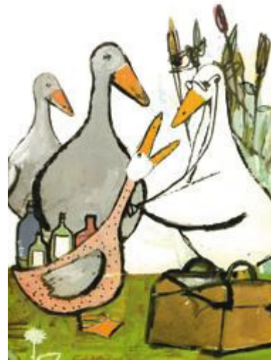
Borka, the Goose With No Feathers

out during this period of non-military duties was slum clearance in the Govan district of Glasgow and some of his sketches of life in this tough, industrial environment will be included in the exhibition. On the strength of these sketches he was fast-tracked onto a course in graphic design and illustration at the Central School of Arts and Crafts in London, where he met fellow student Helen Oxenbury, who he married in 1964. She is also a well-known illustrator of children's books.